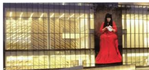
The LED basket weaver is a highlight of the Madden Library

Cost is expected to be approximately $3.50 per person (not including lunch money or transportation expenses).