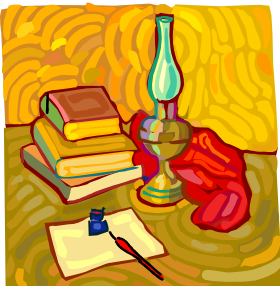
Study usually pays off

The test consists of three important sections: Math, Critical Reading, and Writing.