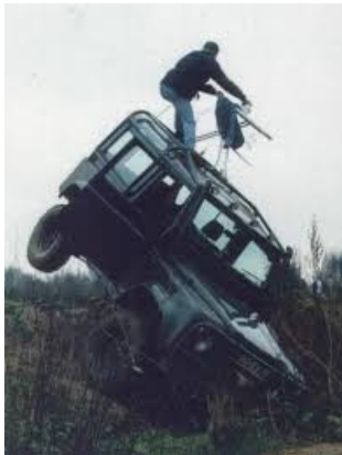
NOT AS COOL AS EXTREME IRONING, BUT CLOSE...