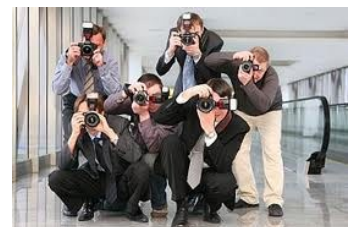
Dahling, you look Mah-velous!

are necessary- you can come on a “drop-in” basis. Year-book pictures are pretty important, and will be used for student I.D cards also, so get your smiles ready and don’t miss it! Photo packages are available with your charter teacher, and ID cards are free.