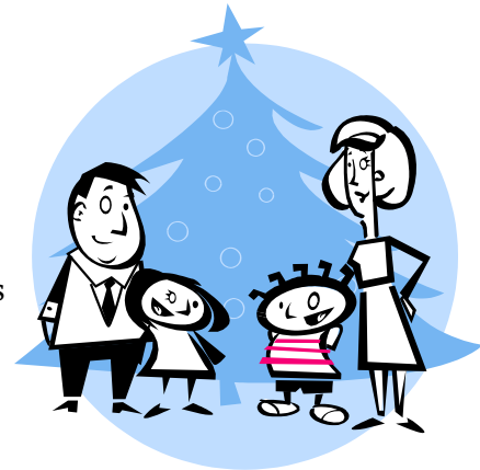
Homeschool Holidays Edition

Power outages may make internet use impossible during major storms— it is hoped that the new “all call” system will allow for contact to be made even when the power is down.