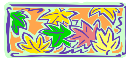
Falling leaves are beautiful... but then you've got to rake

The Common Application is now available at www.commonapp.org Visit this website to see which colleges and universities use this application. This application could save you time as it is good towards applying to more than 400 colleges!