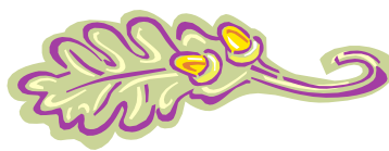
Squirrels love this time of year!